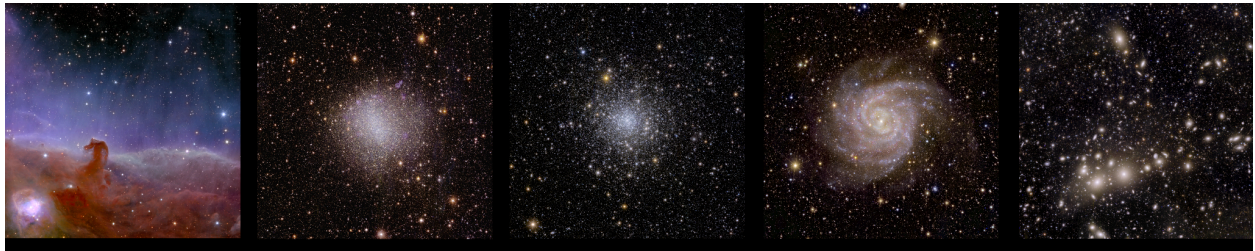
The five first Euclid ERO images. See footnote for details.

An Early Release Observations program was conducted during Euclid 's first months in space as a first look at the depth and diversity of science Euclid will provide. A total of 24 hours was allocated towards specific targets chosen to produce stunning images, also relevant for scientific research. Five of these images were released in November, 2023. The remaining five are being published today, May 23rd, 2024, by ESA 12 .